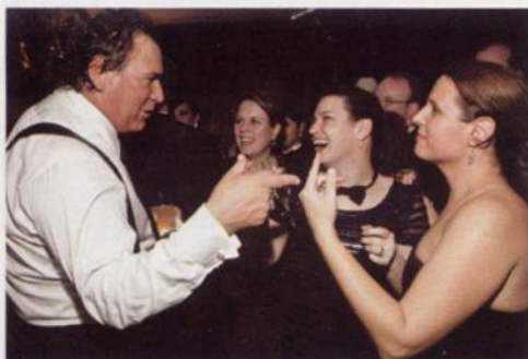
Clockwise from top left: Exterior view of Hotel ZaZa; the ballroom at Hotel ZaZa, decorated by The Events Company; the Ecuador ceremony in a traditional Spanish-style church; a mod lounge scene at the Hotel ZaZa affair; and friendly company during the Texas reception.